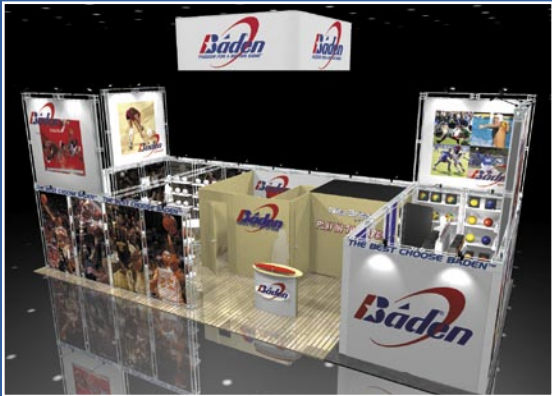
20' x 40'

Skyline exhibit systems are the ultimate in versatility. Our modular components reconfigure to fit varying exhibit spaces, while maintaining consistent branding and functionality. Using portions of your island exhibit for smaller shows means you don't have to invest in – and manage – multiple exhibits.