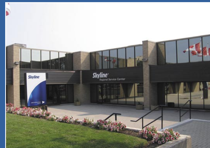
Skyline Regional Service Center, Toronto