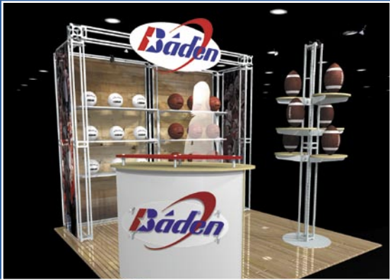
10' x 10'