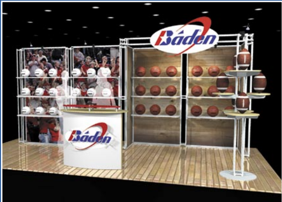
10' x 20'