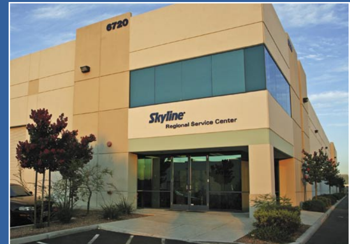
Skyline Regional Service Center, Las Vegas