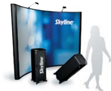
Portable Displays, page 2