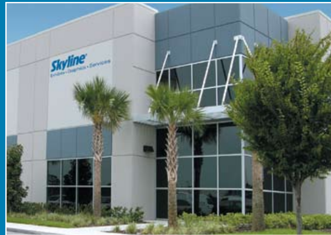
Skyline Regional Service Center, Orlando