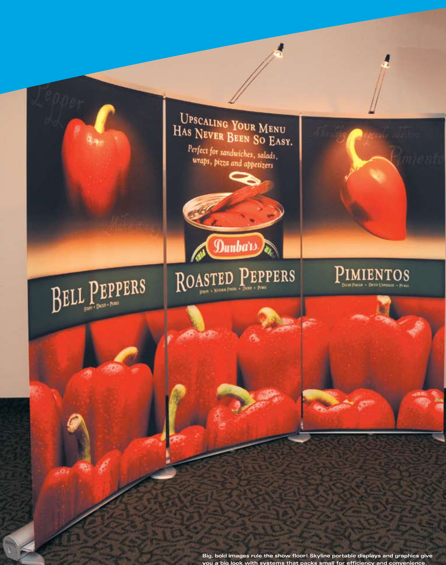
Big, bold images rule the show floor! Skyline portable displays and graphics give you a big look with systems that packs small for efficiency and convenience.