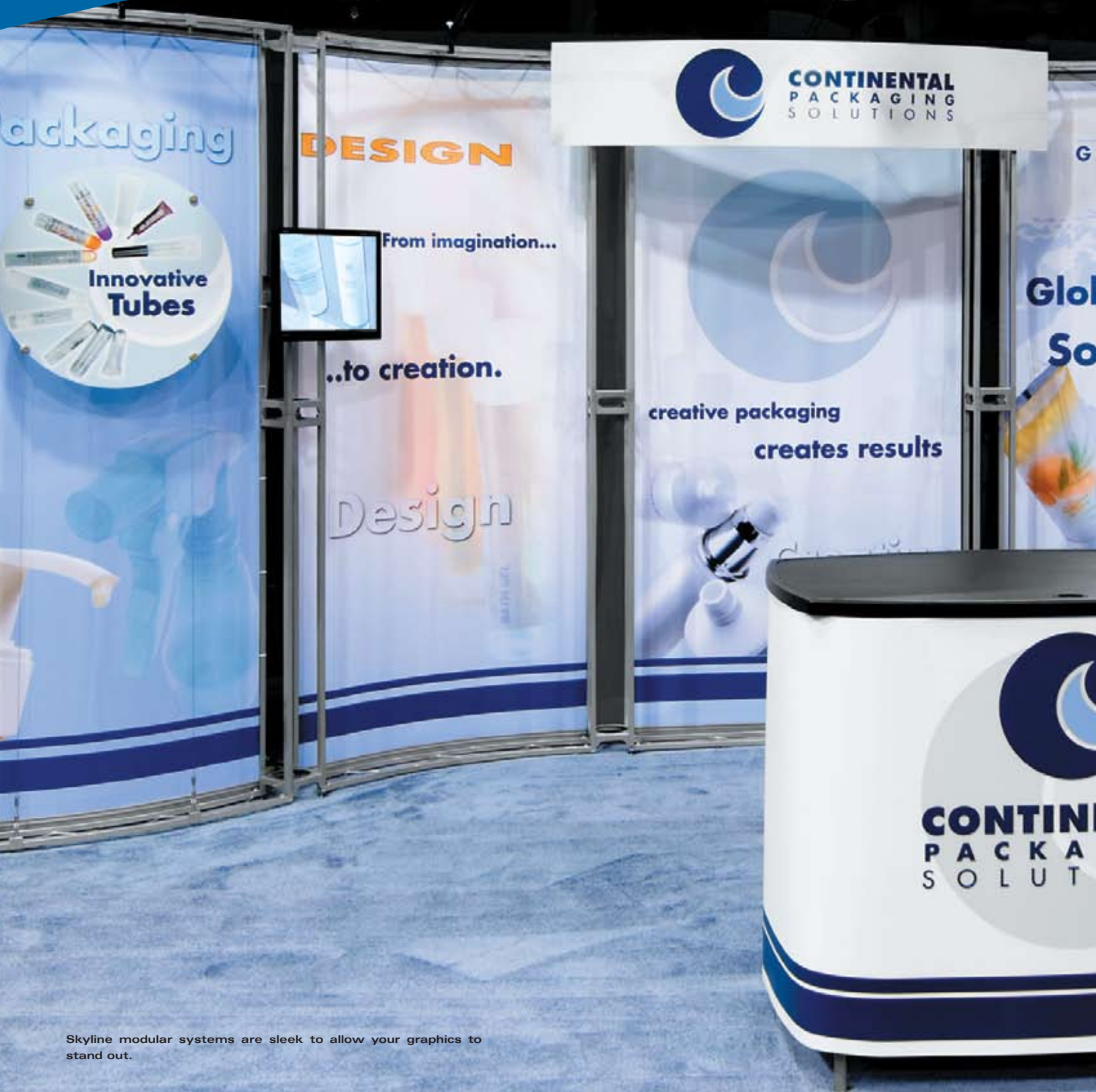
Skyline modular systems are sleek to allow your graphics to stand out.