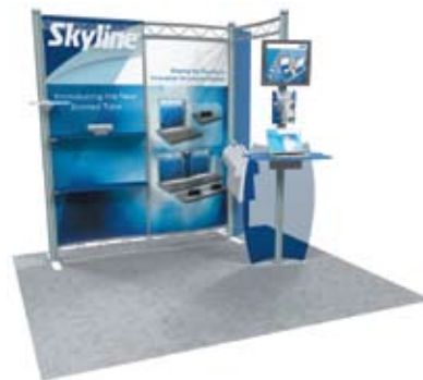
Modular Exhibits, page 10