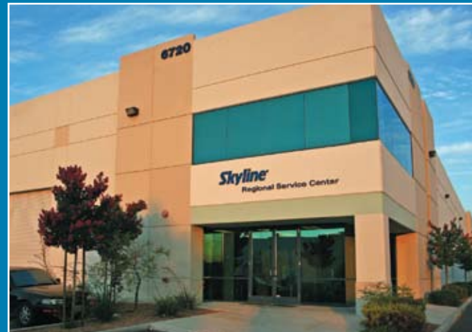
Skyline Regional Service Center, Las Vegas

Regional Service Centers located in Las Vegas, Orlando, St. Paul, Toronto, Mexico and China.