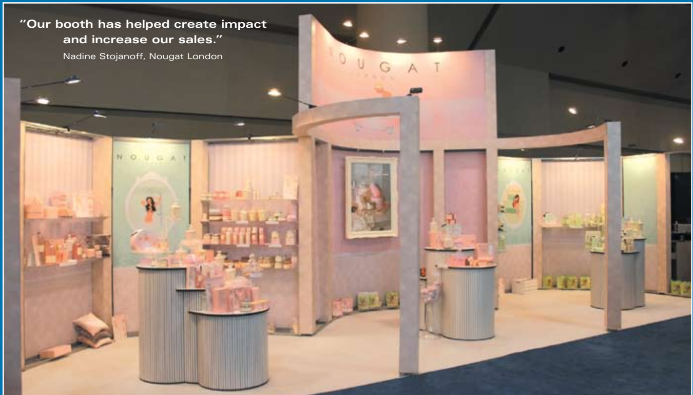
Nougat London can reconfigure its exhibit in 10 layouts and twice has won best-of-show honors.

The perfect vehicle to showcase all kinds of products! Skyline modular systems are stylish, sturdy and versatile so you can display your products with architecture that reflects your brand and graphics that promote your marketing message – along with the flexibility to adapt to your ongoing needs.